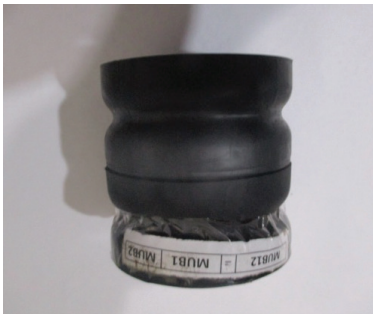
SAMPLE AS RECEIVED