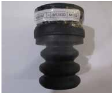
SAMPLE AS RECEIVED