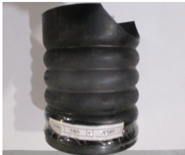
SAMPLE AS RECEIVED