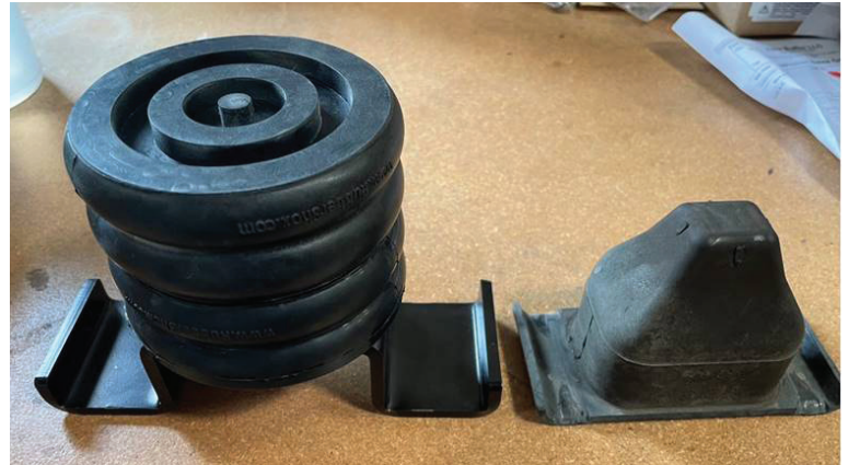
UB1 (Top) +UB2 + Z1-UBS (Bracket) vs. GMC Canyon OE Bump Stop

UB1 (Top) + Z1-UBS (Bracket) Installed for daily driving. Patent pending: modular design bump stop. Add oneUB2 or two UB2(UB3 model equivalent) when towing heavy boat/trailer, prevent rear end drooping and provide more support on load by adding multiple UBS module.