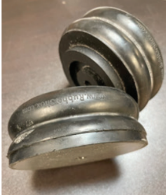
UB1 (Top) +UB2

IMPORTANT NOTICE: RUBBERSHOX INSTALLERS SHOULD APPLY COMMON AUTOMOTIVE SAFETY PRACTICES WHEN RAISING, LOWERING AND WORKING ON VEHICLES, ALWAYS WEARING SAFETY GLASSES, USING BOTH HYDRAULIC JACK AND JACK STAND DURING THE INSTALLATION. We recommend that this installation be done by a professional or person with auto mechanical knowledge. RubberShox Universal Bump Stops are designed to work with original factory springs only. These instructions are general guide line. RubberShox assumes no liability for actual installation process. Rubbershox does not recommend exceed the maximum load recommended by vehicles manufacturer (GVWR)