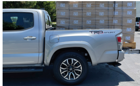
After loading 1,180 Lbs. weight. The truck slant to end rear.