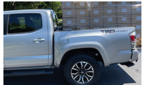
After replaced with UB1+UB2 or our UBS series bump stop. The truck looks flat from front to back with the rear height 35".