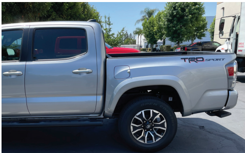
2021 Toyota Tacoma TRD sports V6 4 wheels drive.