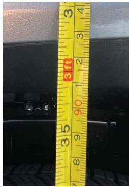
Ground to rear wheel fence, 36.5"