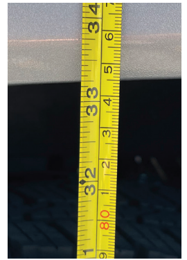
Ground to fence height around 33".