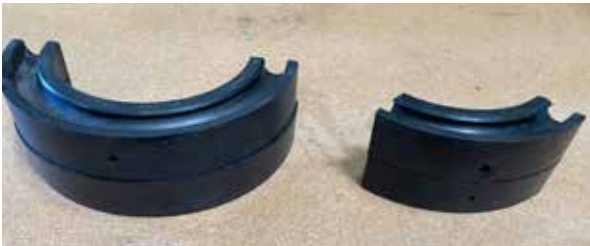
Left : UCSBH12344 – Using UCSBH1 and UCSBH2 Right : UCSBH12344 – Using UCSBH1 and UCSBH2