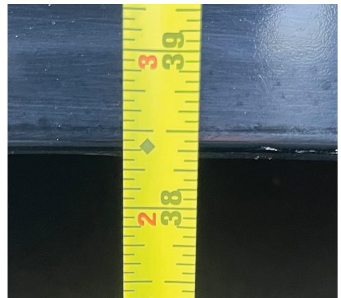
Around 1.25" ground clearance increase